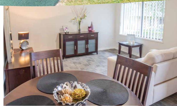
Cooinda Village, 2 bedroom unit