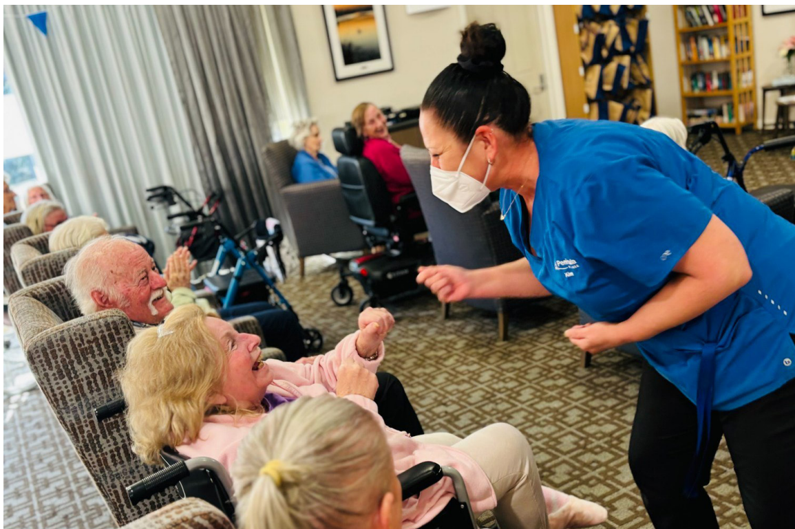
DANCING ON BASTILLE DAY