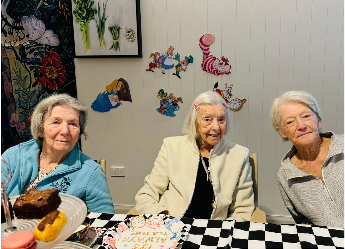
ALICE IN WONDERLAND PARTY