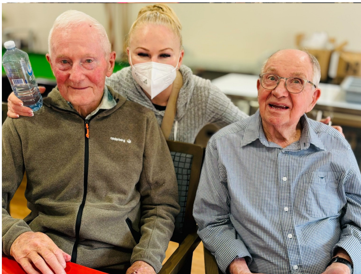
FAMILY ENJOYING CREPES